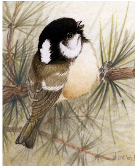
Coal Titmouse