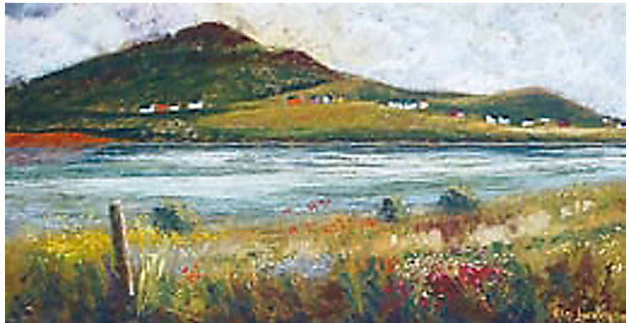
Quebec meets East Anglia in the Fermoy Gallery