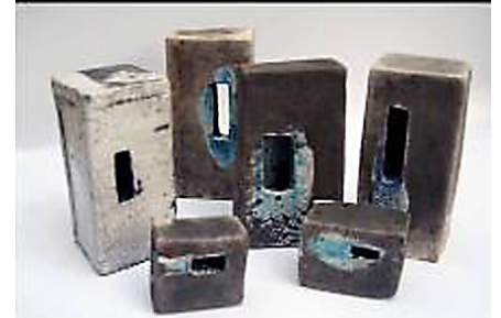
The current exhibition at Greyfriars Art Space